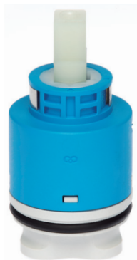
Cartridge with distributor