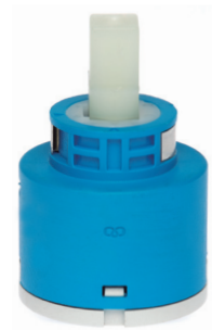
Cartridge without distributor. Specially designed for kitchen applications